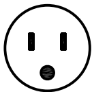
NEMA 5-15P HOSPITAL GRADE