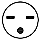
NEMA 6-15P HOSPITAL GRADE